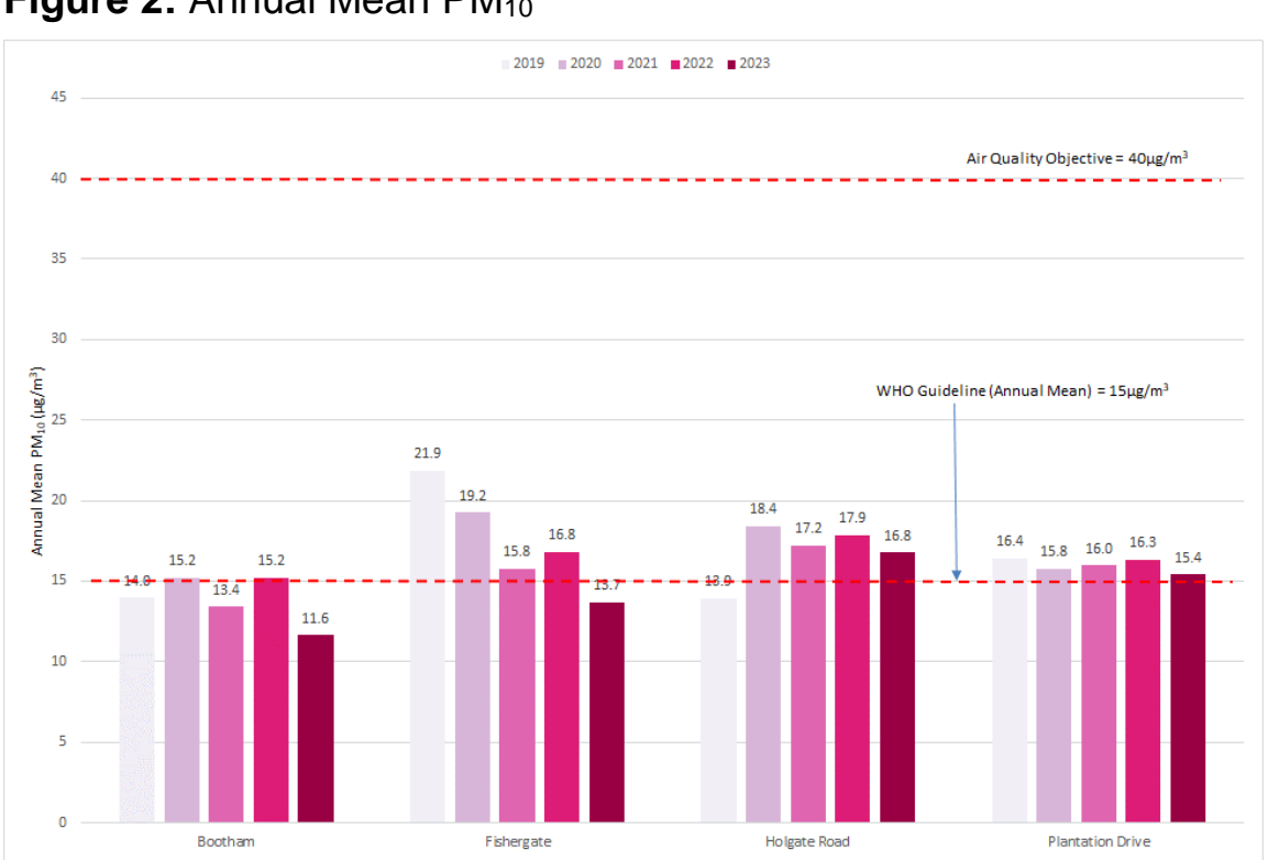
Figure 2: Annual Mean PM<sub>10</sub>